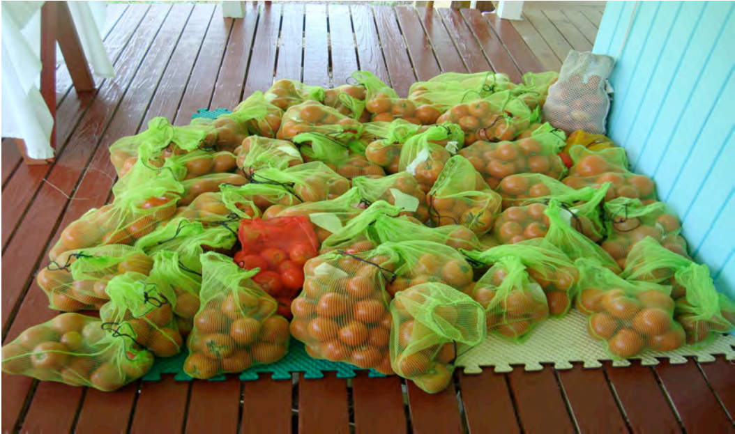
Figure A-7. Consumer preference survey, 2010 organic tomato variety trial, AES, Lajas, Puerto Rico.