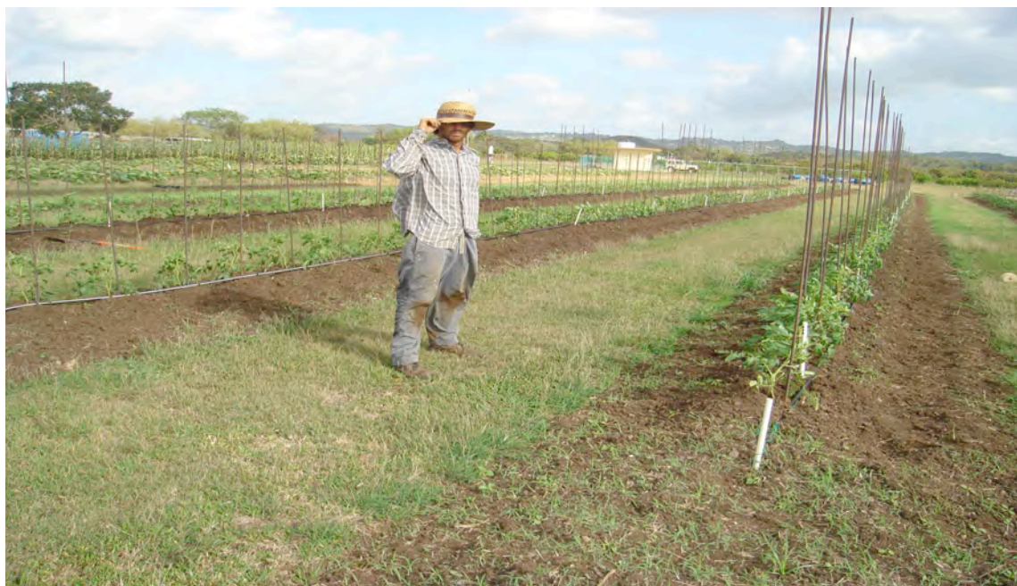
Figure A-2. Experimental site of the 2010 and 2011 organic tomato variety trials, AES, Lajas, Puerto Rico. Picture taken 76 DAT in 2010.